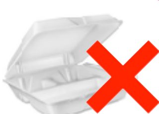
Food Container (carton)