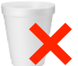
Food Container (cup)