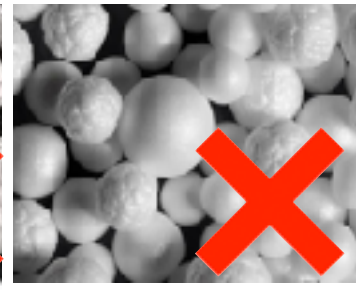
Popcorn (too small)