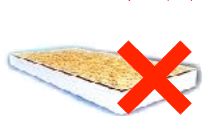
Layered/Glued (particle board)

NOTE: UNACCEPTABLE ITEMS WILL REMAIN IN YOUR VEHICLE