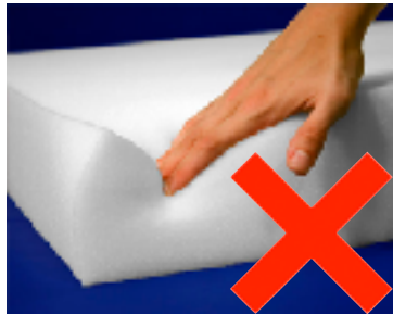
Spongy (Not EPS)