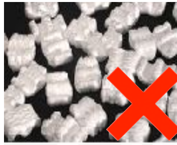
Peanuts (too small)