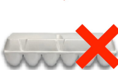
Food Container (egg carton).